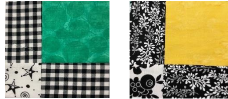
Four examples of bright solid as the big patch.