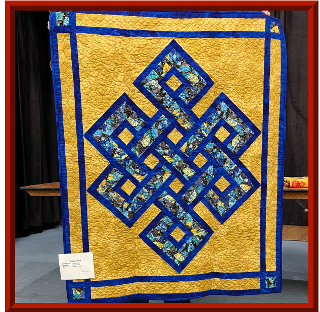
An example of amazing talent from January's Star Quilter, Kanani Jones