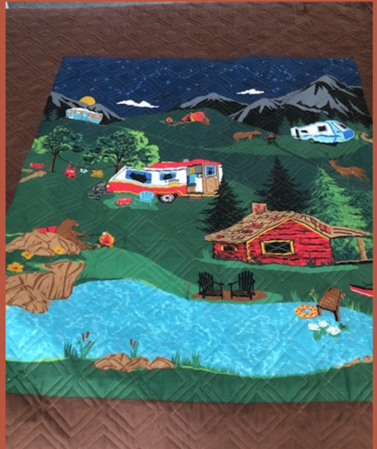
Back of: Don't Feed the Bears