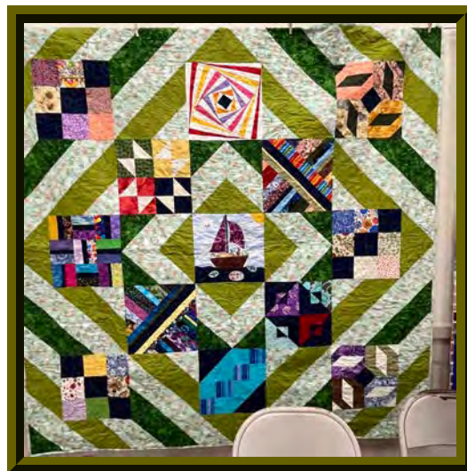
One of the 2025 VP Challenge Quilts. It will be part of the Installation Dinner Quilt Parade.

Since all our focus will be on delicious food and community quilts, we will hold off on extra activities such as cat/dog cuddles, friendship blocks, fabric exchange and Medallions until the October meeting.